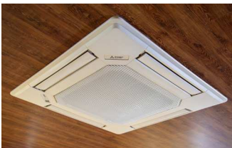
AIR CONDITIONING SYSTEMS

Fortune Park Moksha strives to provide world-class comfort to guests while caring for the environment. Mitsubishi Electric is helping it achieve this with energy efficient Air Conditioners.