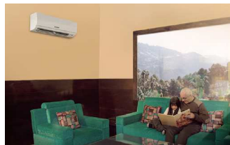
COMFORT ALL THROUGH THE YEAR